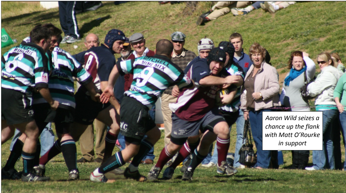
2nd Grade Semi Final - 11th August, 2007