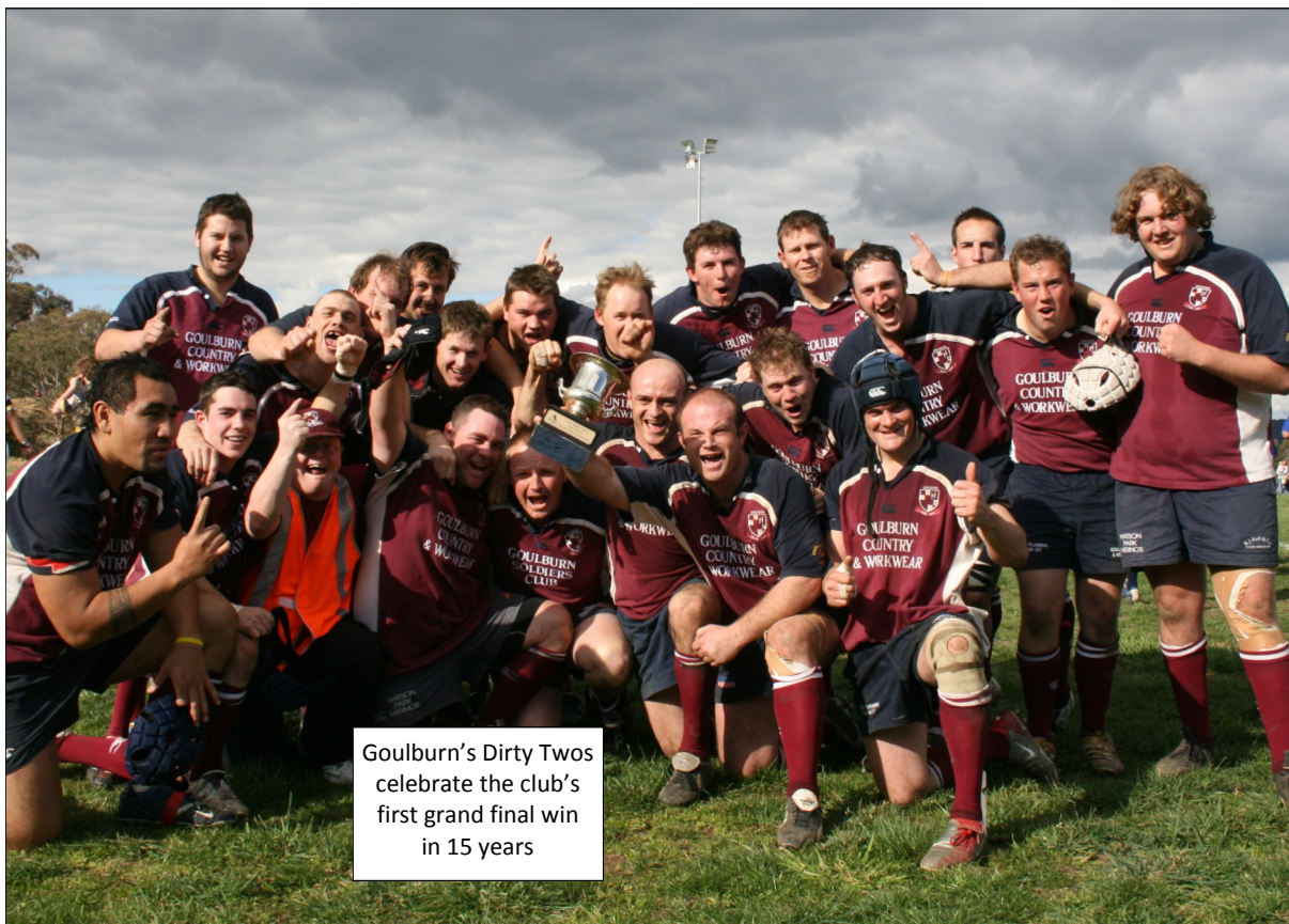
Goulburn's Dirty Twos celebrate the club's first grand final win in 15 years