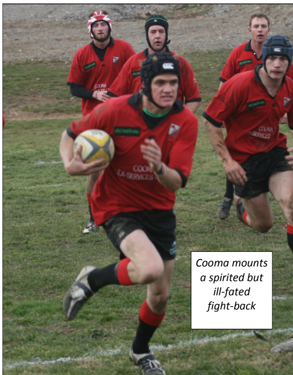
Cooma mounts a spirited but ill-fated fight-back